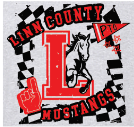
Gray with Red