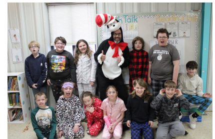
Cat in the Hat came to visit during Read Across America Week!